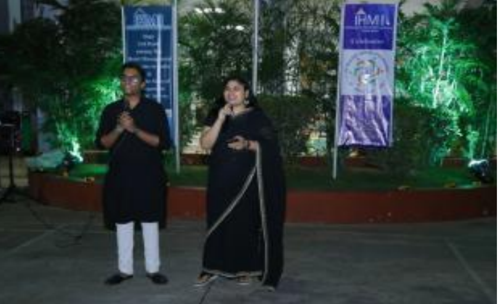
Students singing traditional Punjabi songs

Students participating in the cultural programme