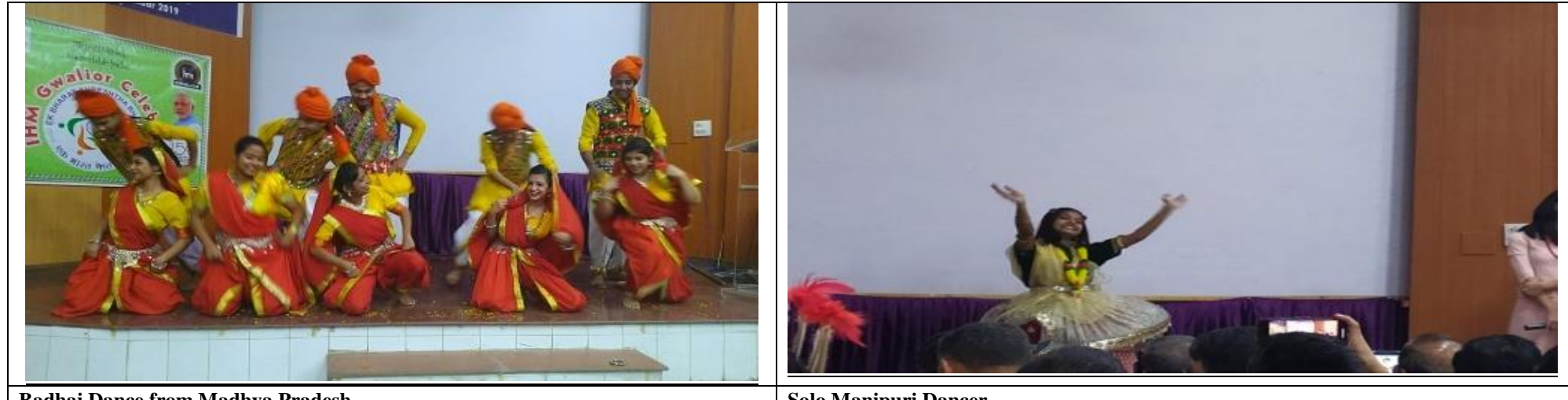
Badhai Dance from Madhya Pradesh